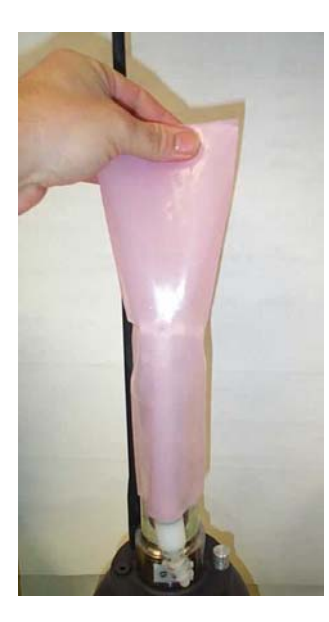
IMPORTANT: Remove plastic bag and three plugs from CTD sensor, if they have not already been removed.

1. Secure float in horizontal position, using foam cradles from crate.